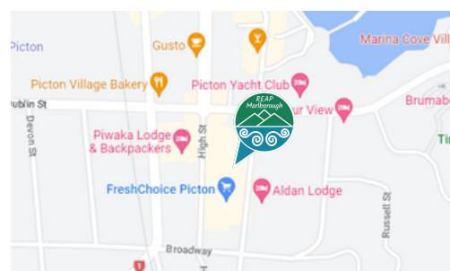
Mariner's Mall, Picton (in the old Picton Resource Centre)

Tatau tātou - All of us count 7 March 2023